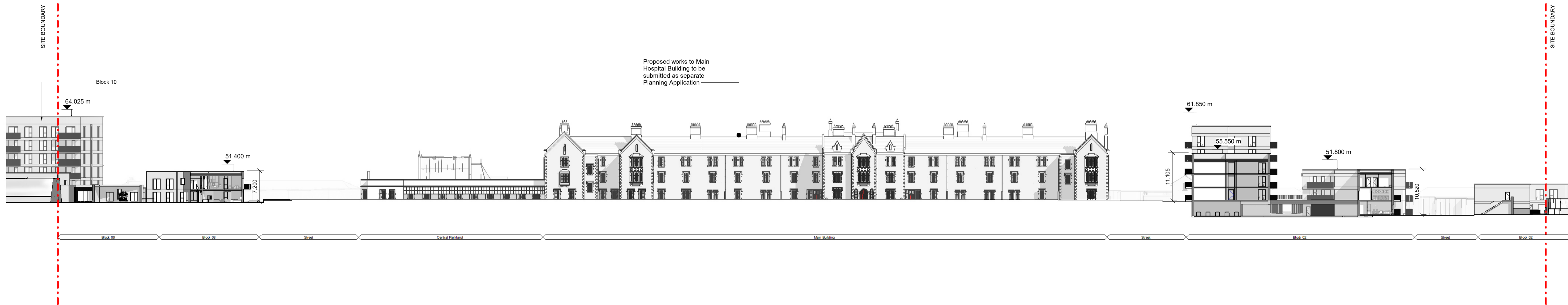
Site Wide Section A-A Part 10 1 : 500