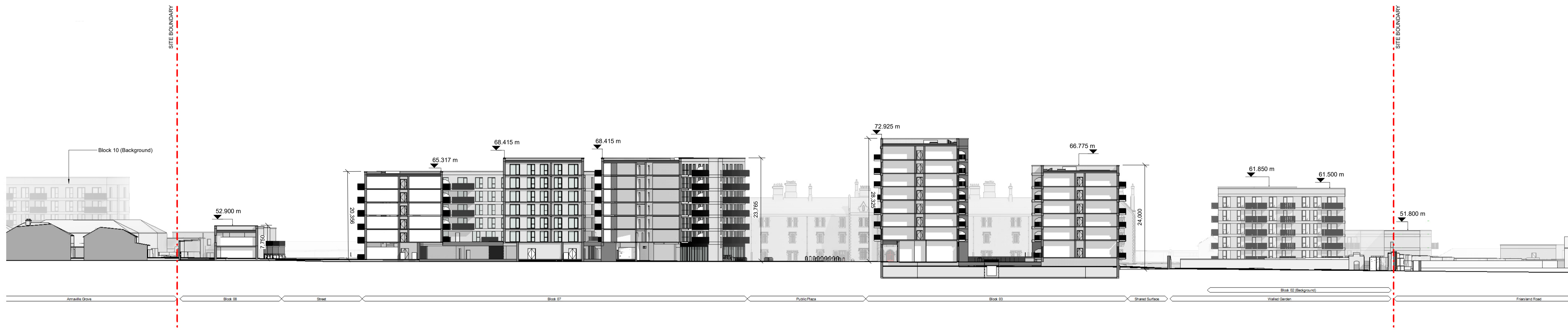
Site Wide Section C-C Part 10 1 : 500

Notes: - Do not scale from this drawing. Use figured dimensions in all cases. - Verify dimensions on site and report any discrepancies to the Architect immediately. - This drawing is to be read in conjunction with the Architect's Specification. - © This drawing is copyright and may only be reproduced with the Architect's permission.